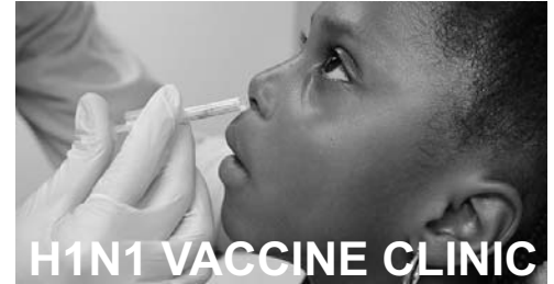
H1N1 VACCINE CLINIC